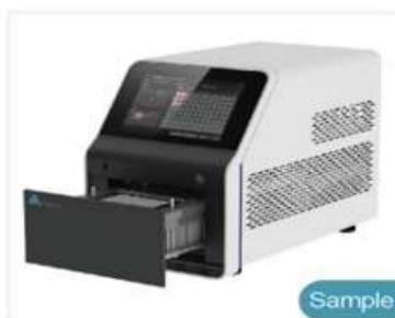
Sample plate automatic out